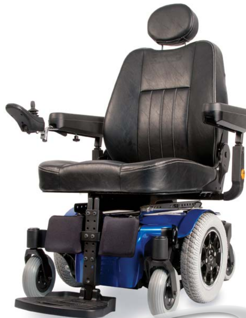
Captain's Seat model shown

Comfort and performance in a proven design