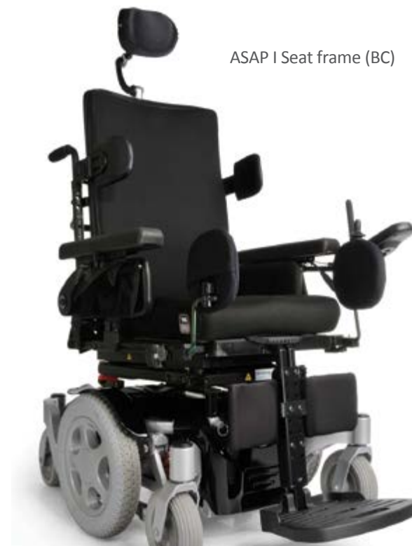
ASAP I Seat frame (BC)