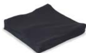
JAY Soft Combi™ P