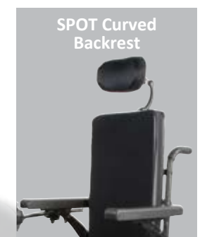
SPOT Curved Backrest