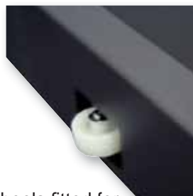
Wheels fitted for easy movement